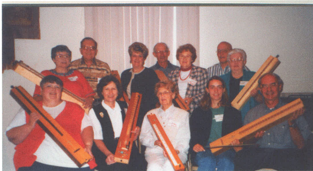
Members attending the Nordic-American Psalmodikonforbundet, September 17-19